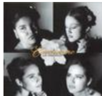
Cancionero Los Cenzontles